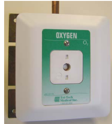
Outlet XQ1124 Shown

The outlet nameplate shall be permanently color coded with a durable, scratch resistant and protective label. The outlet trim plate shall be durable plastic, attached